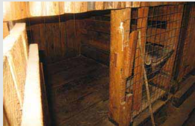
Two types of goat pens; above: a good shelter for goats to stay at night, during daytime the goats are out grazing. Below: a good pen, but the goats have no space for movement; a poor feeding system, as the goats are walking on their feed leading to more wastage.

Goats kept on zero-grazing generally have very little room outside their stall in which to exercise. Some goats we have seen do not even have a pen to roam in; they spend their entire life in a stall. This, without doubt, severely restricts their growth and is extremely detrimental to their well-being. It is, therefore, very important that, no matter how small the farm is, goats have access to at least a small pen during the day.