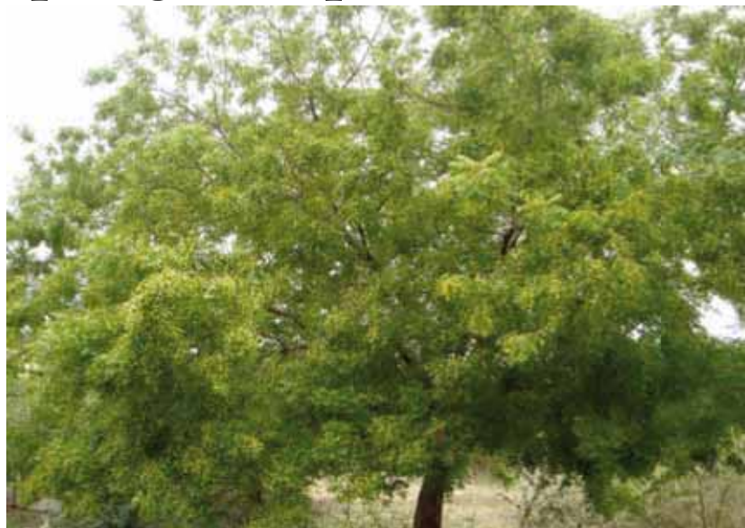
A fully grown neem tree can produce up to 50 kg of seeds in a year.

- Achook: Made in India, available in Agrovet shops.