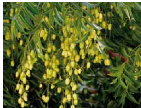
Most farmers take the tree Melia Azedarach (left) which grows in most highland areas in Kenya for the neem tree (right). The two trees are different—so be careful when buying seedlings.