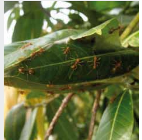
Weaver ants on a mango tree

between mango trees in an orchard to facilitate the movement of the ants from one tree to the next. Existing weaver ant colonies can also be harvested and introduced to other trees in the orchard where they are not present. The weaver ants technology are being promoted in many countries of West Africa, in Tanzania and in Asian countries. (Sunday Ekesi)