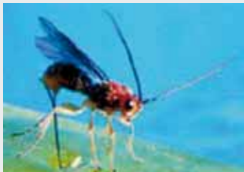
The wasp Fopius arisanus

One of the methods of controlling fruit flies is the use of beneficial insects or parasites also called parasitoids. One of an efficient biological control agent is the wasp Fopius arisanus which is very effective at controlling the fruit fly Bactrocera invadens . It attacks the eggs of the fruit fly and develops through the larval stages of the fruit