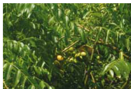
Neem tree with ripe fruits

In the last few weeks we got a good number of questions from farmers on this wonderful tree, we tell you how to make your own extracts from neem and how to use them. Page 3