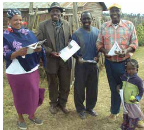
Well-informed farmers improve their livelihoods. Our picture shows a group of farmers after a TOF training

It all comes back to the formation of an association. An individual cannot be able to convince the government to take notice of problems on any sector. This is especially for small-farmers who in the eyes of many have no say. However, once we are organised and represented as a serious organisation we will have some power. We will be able to influence those that hold office in our interest to perform their duties. We will be able to eradicate the