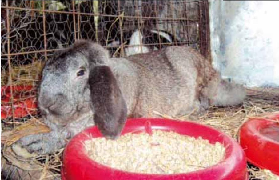
Rabbit keepers need knowledge on feeding, housing, breeding and also a market