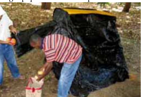
An augmentorium attracts fruit fly predators

Poorly managed or abandoned orchards and a variety of wild hosts can result in high population build up of fruit flies.