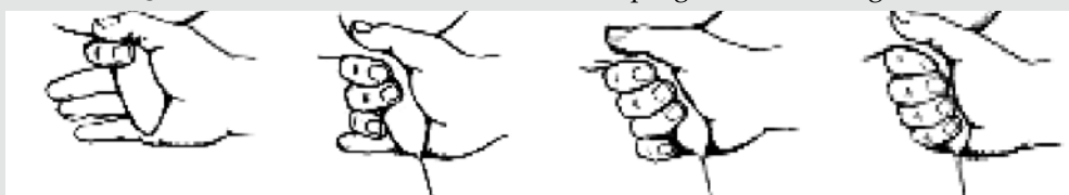
The "squeeze"-method as shown in this illustration is the best method to milk cows and goats.

When the fore-udder is nearly empty, change to the back two teats. When the milk flow ceases, you may go back to the front teats, or you may let the calf finish off and take the last few drafts. If the calf is already weaned or is not allowed to suckle, the best practice is to use an effective teat dip right after milking.