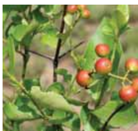
The seeds of Carissa edulis (mutandambo in Kiswahili) have medicinal properties.