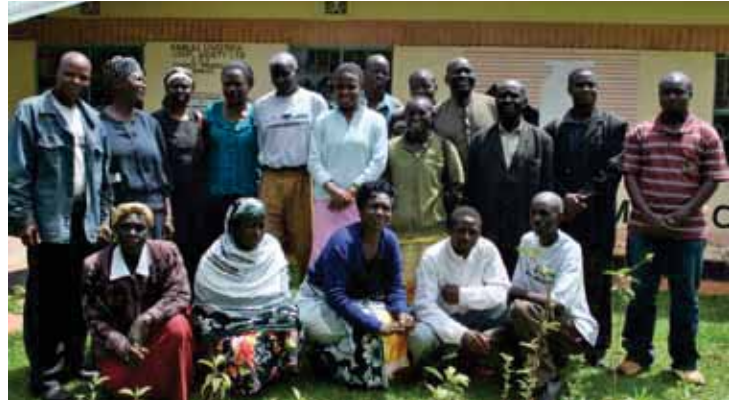
Maeni farmers' group at a local milk cooling plant.

As a requirement of the microfinance company, the 22 Maeni Group members, who had by now joined the Kimilili Livestock Co-operative Society Limited, started saving Ksh 100 per week. At the same time they underwent training, mainly focused on record keeping, managing funds and ways of improving farming. This took two months, beginning May