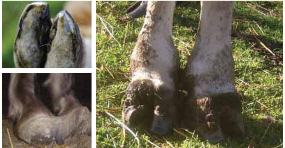
Poorly trimmed hooves interfere with an animal's movement and production as well.

The condition of the feet and legs on all hoofed animals should not be taken lightly. A cow with sore feet feels uncomfortable and may reduce her milk production, diminished breeding efficiency and decreased salvage value in the case of severe lameness. Periodic hoof trimming is necessary for cows, goats and sheep to reach their full genetic potential. If a farmer is not able to trim the hooves of their animals, they should engage the services of a veterinarian or an experienced hoof trimmer. We are often disappointed when visiting the shambas of experienced organic farmers: The gardens are professionally managed, but the shelters of the animals look terrible, some animals appear lame due to unattended hooves.